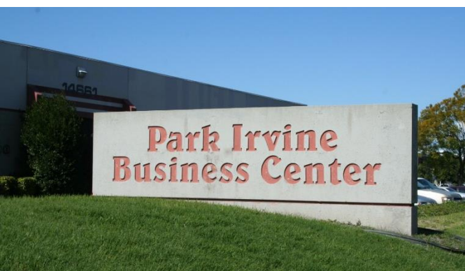
HIGH IMAGE BUSINESS COMPLEX